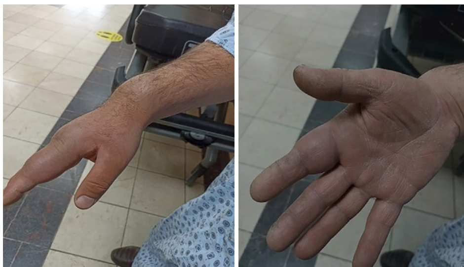
Figure 1: Swelling of the index finger and wrist of the right hand

The respiratory system examination was unremarkable. Laboratory investigations, including routine biochemistry, complete blood count, C-reactive protein, antistreptolysin O, rheumatoid factor, antinuclear antibodies, serum and urine calcium levels, and respiratory function tests, were all within normal limits. The interferon-gamma release assay (IGRA) and polymerase chain reaction for TB were negative, and the tuberculin skin test was anergic. Computed tomography (CT) imaging of the thorax revealed multiple conglomer-